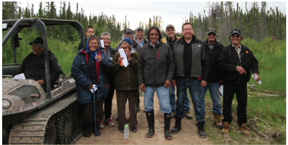
Elders from Marten Falls and Webequie visit the future site of the Eagle's Nest mine

Everyone who knows Noront understands that we believe in the potential of the Ring of Fire. That’s why we’ve continued to stake claims and acquire companies when others have lost faith or can’t afford to continue. We also understand it is important to local communities that they participate in our project development and share in the benefits. These are some of the reasons we’re proud to have so many local workers. (continued on next page)